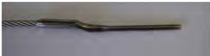
Pic. 6 Pressed pin USA, flat press (e.g. the press at the line is flat)