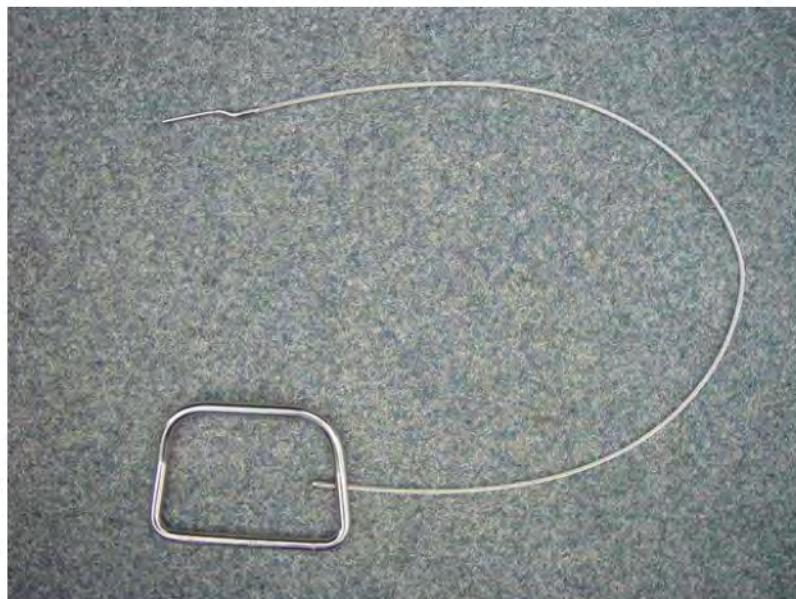
Pic. 2 Ripcord Handle U-051