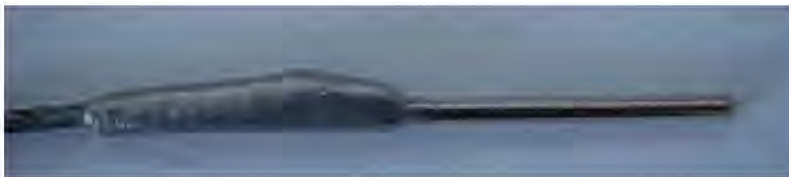
Pic. 5 Soldered pin

Service bulletin does not refer to these pins: