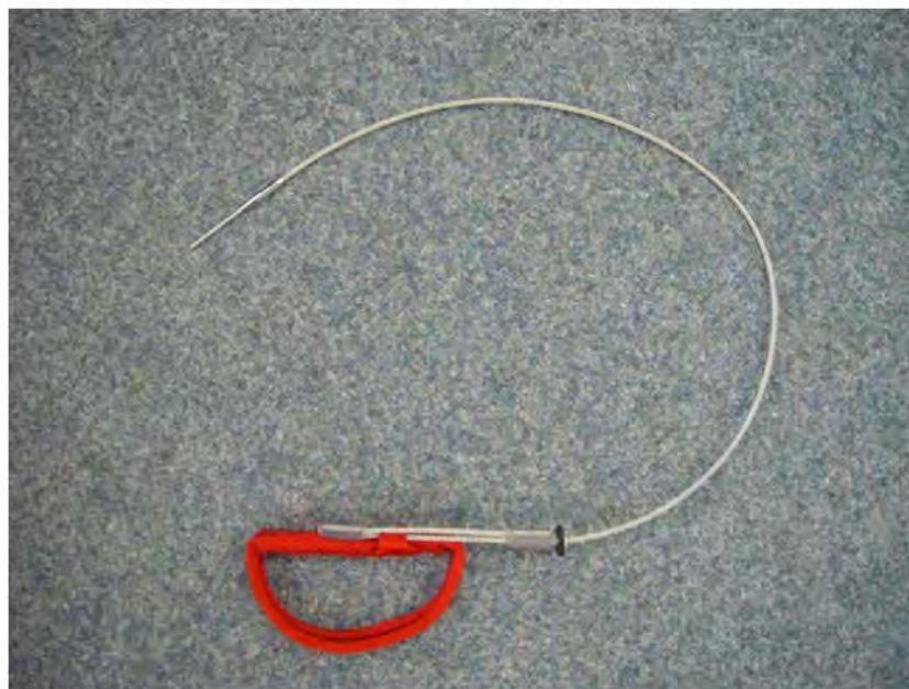
Pic. 3 Ripcord Handle U-069