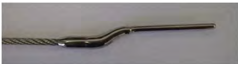
Pic. 4 B Pressed pin – bent, hexagonal press