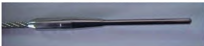
Pic. 4 A Pressed pin – straight, hexagonal press (e.g. the press at the line has the hexagonal shape)