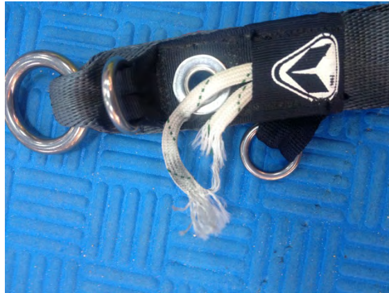
Figure 10: Damaged, Partially Cut