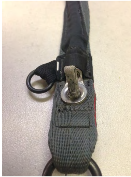
Figure 6: Damaged, Frayed