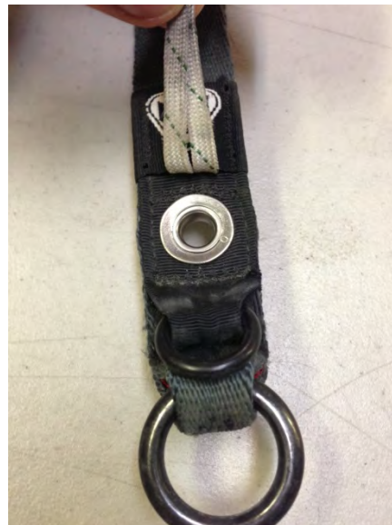
Figure 4: Normal Wear, Back