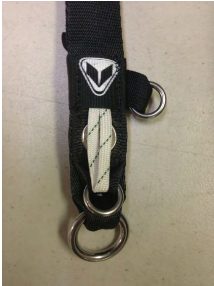
Figure 3: New Locking Loop

The following picture shows a new riser locking loop.