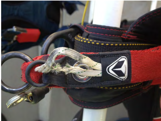
Figure 9: Damaged, Partially Cut