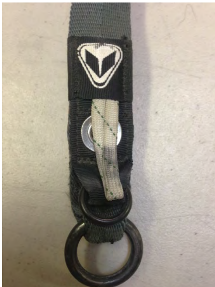
Figure 3: Normal Wear, Front

The following pictures show locking loops with normal wear.