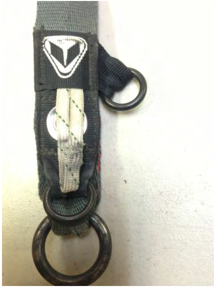
Figure 5: Damaged, Frayed

The following pictures show locking loops with damage; heavily frayed and partially cut.