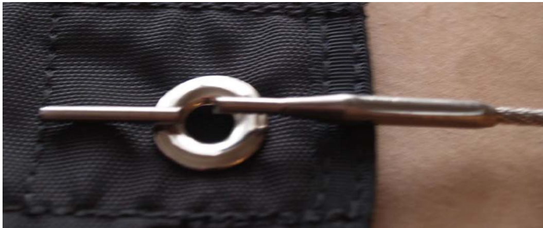
Pic 1. Broken pin shown over "0" grommet

BACKGROUND: A reserve being closed after repack had the terminal pin of the ripcorder break as it was inserted into the closing loop. The rigger had closely inspected the pin prior to attempting to insert it and it was straight without any visible defect. The pin fractured 0.40" (10mm) from the shoulder at the place where the CYPRES closing loop would sit. The rig, a PA Talon was manufactured in 07/ 96 and the ripcorder was unmarked and presumed to be original as no other data was available on the log card to indicate otherwise. The ripcorder is outside the date period as noted in Capewell SB No. CW03-01 and there are no indications that it may have been previously tested.