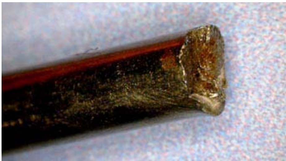
Pic 2. Broken body end of pin magnified.